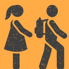
On the way to/from school